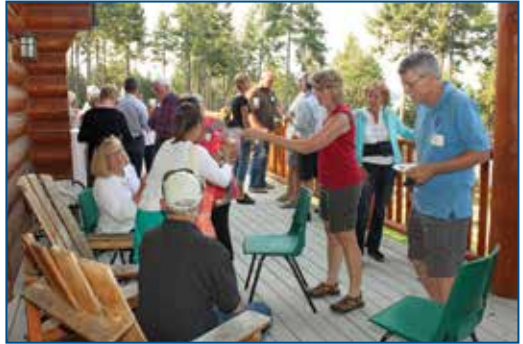
Flathead Lakers members chat with board members on the deck at the Glacier Camp and Conference Center at our 2013 Annual Meeting.

Restoration & Conservation Tours: Over 40 landowners, resource managers, and others participated in three tours of riverbank and wetland conservation and restoration projects. These tours provided information about the benefits of critical lands conservation, how restoration projects along the Flathead River are protecting water quality, healthy habitat, and improving river bank stability, and how the River to Lake Initiative partners can help landowners with conservation and restoration projects.