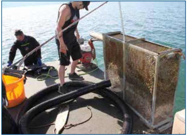
Ace Diving personnel removing the invasive aquatic weed curlyleaf pondweed from a site on Flathead Lake.