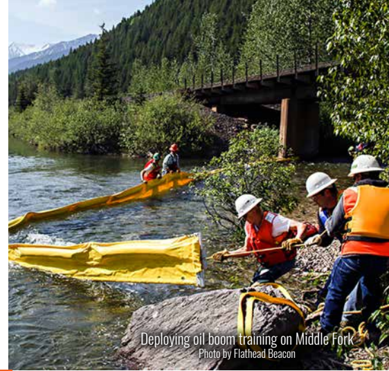
Deploying oil boom training on Middle Fork

The people of Montana have every right to participate and comment on the development of a “Prevention Plan” that does everything possible to reduce the likelihood of an oil train derailment.