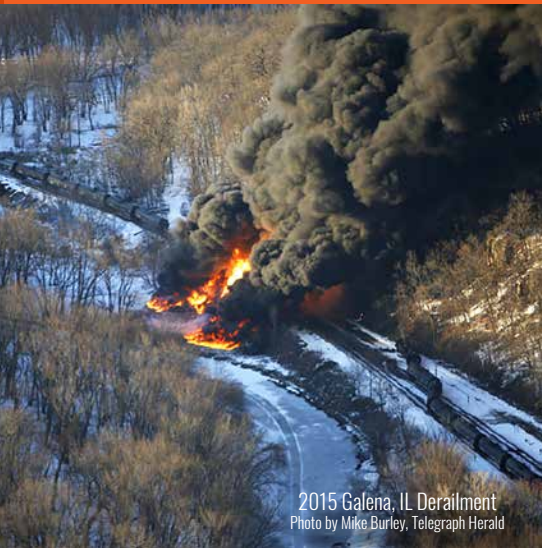
2015 Galena, IL Derailment

TRAINS HAULING EXPLOSIVE, TOXIC CRUDE OIL PLAY RUSSIAN ROULETTE WITH MONTANA'S CLEAN WATER, JOBS, RECREATION, AND WAY OF LIFE. We deserve to know the plan for preventing a disaster and if disaster strikes.