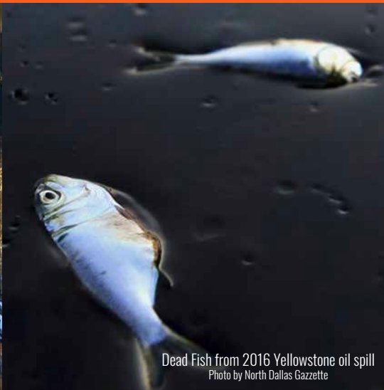
Dead Fish from 2016 Yellowstone oil spill