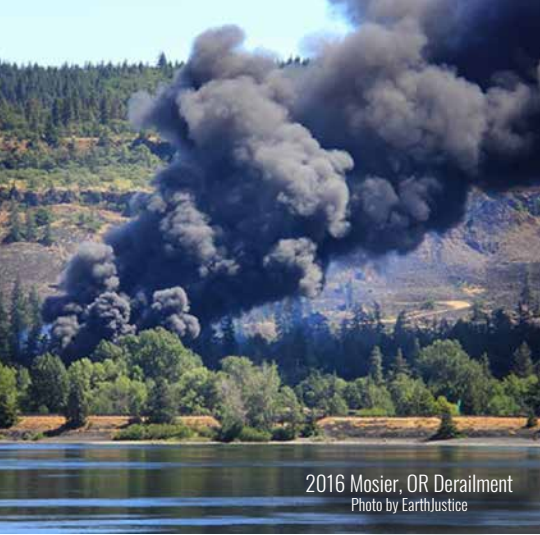
2016 Mosier, OR Derailment

The people of Montana have every right to participate and comment on the development of a “Prevention Plan” that does everything possible to reduce the likelihood of an oil train derailment.